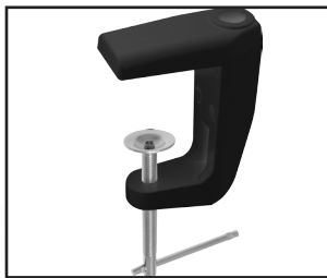
Heavy-Duty Mounting Clamp

Color Temperature Range: 3500K - 6500K Illumination: Max 1100lm