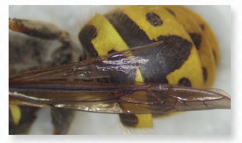
Excellent Color Reproduction

LED Ring Light Provides uniformity & shadow free illumination