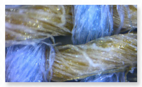
Excellent Color Reproduction