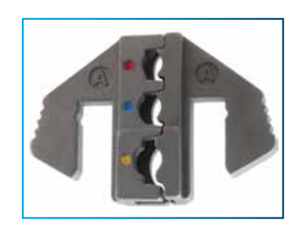
Die Jaw Type: A #10188D