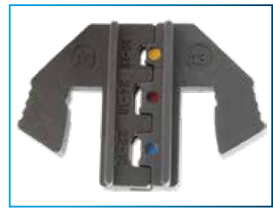
Die Jaw Type: A3 #10189D