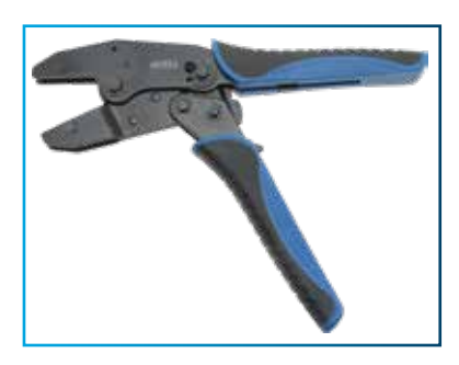
Crimping Tool Frame # 10195

Aven's professional grade crimping tool has a smooth and efficient ratcheting mechanism that creates uniform and secure crimps. Ideal for professional electricians and DIY enthusiasts. Tool and dies are made from alloy steel for durability. This kit features quick-change dies that are easy to exchange with no tools required.