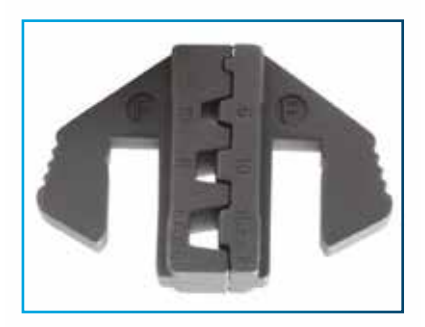
Die Jaw Type: F #10179DS