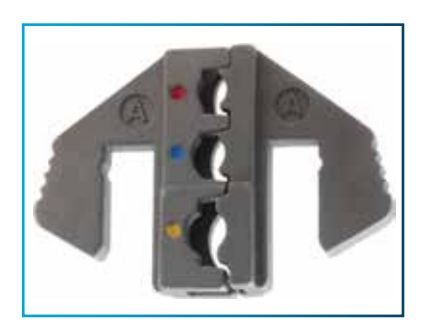
Die Jaw Type: A #10188D