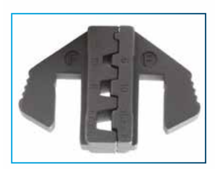
Die Jaw Type: F # 10179DS