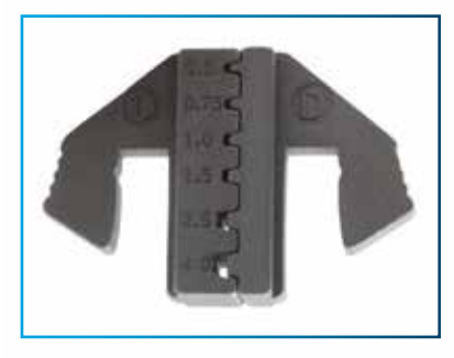
Die Jaw Type: D # 10178DS