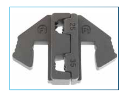
Die Jaw Type: F1 #10187D