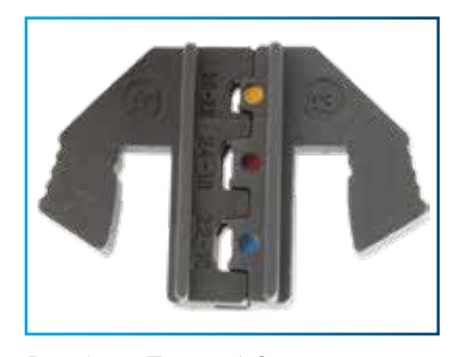
Die Jaw Type: A3 # 10189D